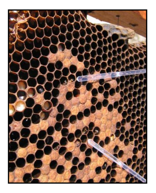
Slumped larvae in unsealed cells