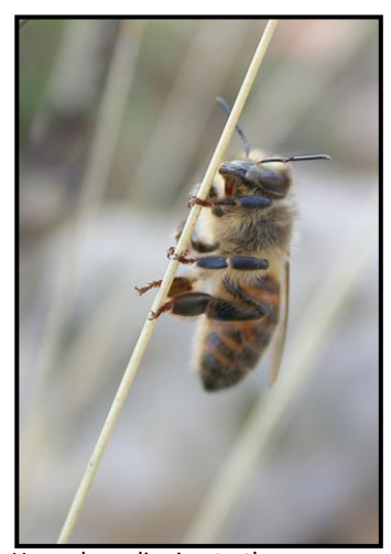
Honeybee clinging to the grass

This disease form has been designed to recognize the clinical signs of the disease in the honeybee colony.