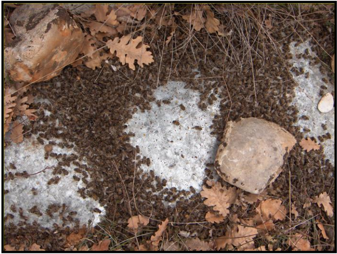
Dead honeybees in front of the hive